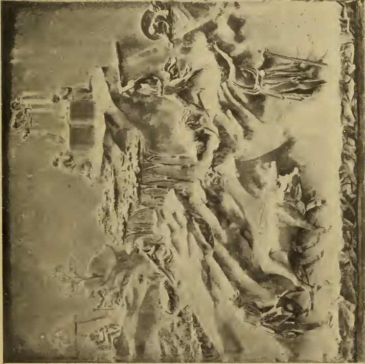
CAIN AND ABEL

PANELS FROM THE SECOND BRONZE DOORS BY GIBBERTI AT THE BAPTISTERY